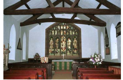
Supper at Emmaus

Stained glass window in Jesus Church, Troutbeck, England Ford Madox Brown, designer